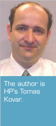
The author is HP's Tomas Kovar.

Many of us have had that dizzying moment of shock and confusion — we've just opened the bill from our service provider, only to find that it totals hundreds of Euros more than we were expecting. As Tomas Kovar writes, we race through each line item, until our eyes alight on an entry showing dramatically inflated charges for roaming.